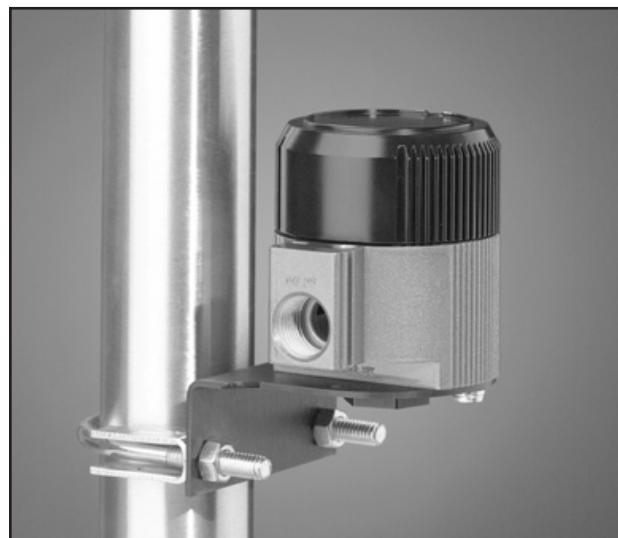
Moore Industries' PIH pressure-to-current transmitter is ideal for mounting in rugged field environments.

CE Conformant – EMC Directive 2004/108/EC EN61326